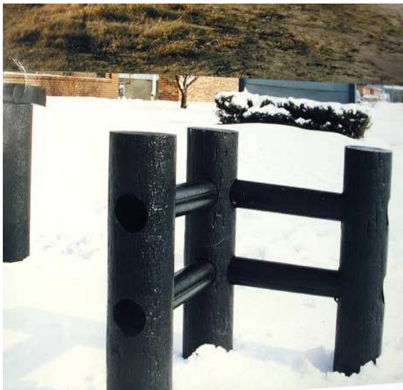
SIX INCH ROUND POST WITH FOUR INCH ROUND SLATS